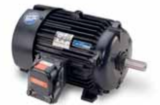
Blue Chip XRI® Premium Severe Duty Dual Label