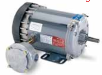
56/140 Frame Explosion Proof Class I Groups C & D, Class II Groups F & G