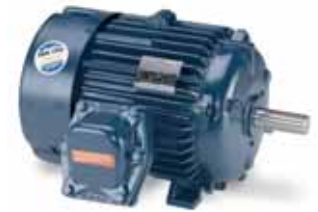
Blue Chip® Severe Duty Single Label